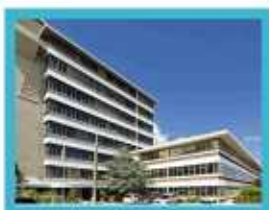
Commercial Spaces (Offices / Shops)