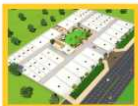
Plotting Schemes / Holiday Homes